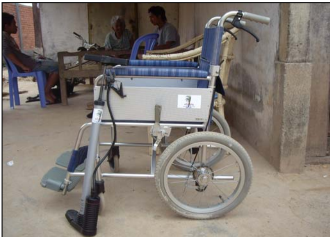
This is a wheel chair labeled with Cambodian Ministries for Christ.