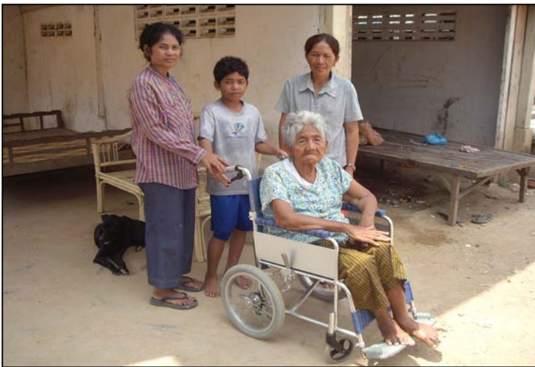
The members of her family are very happy that Cambodian Ministries for Christ International provided their mother or grandma with this wheel chair, which makes her be able to move anywhere more easily. Their pray is that May Cambodian Ministries for Christ International progress to help poor people because there are many elder people and handicapped in Cambodia.