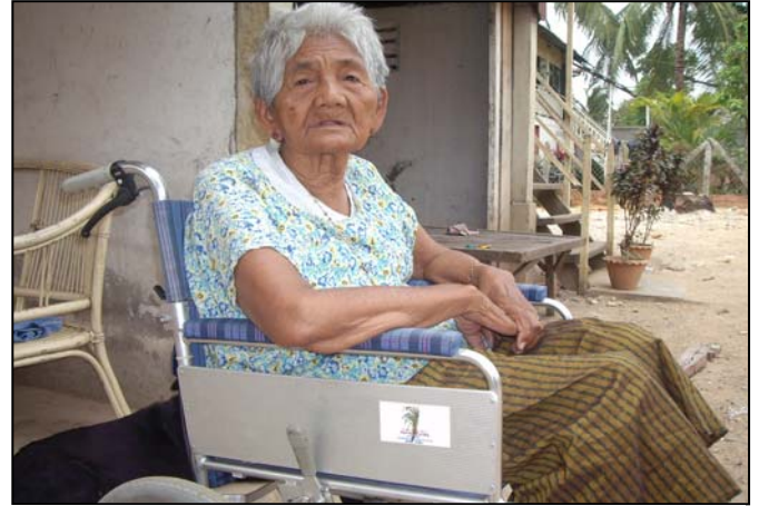
Grandma is very happy that the donor pays attention to Her, a poor handicapped. Therefore, her pray is that May all donors peaceful in Jesus Christ.