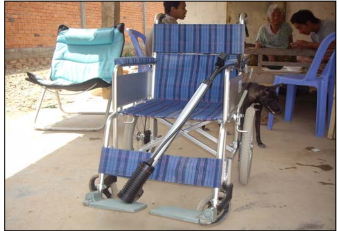
This is a picture of a wheel chair with an air pump.