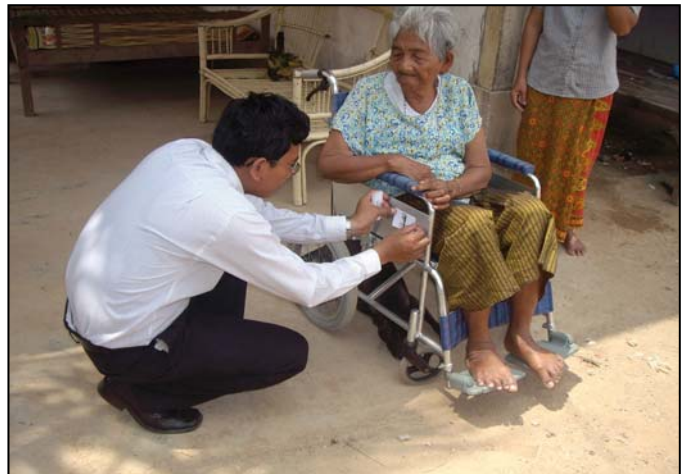
Cambodia-based Director of Cambodian Ministries for Christ stuck a label with Cambodian Ministries for Christ on the wheel chair.